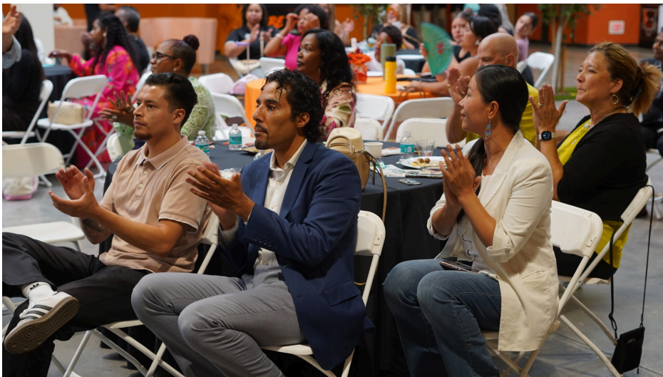
Audience members applaud enthusiastically in support of local entrepreneurs.