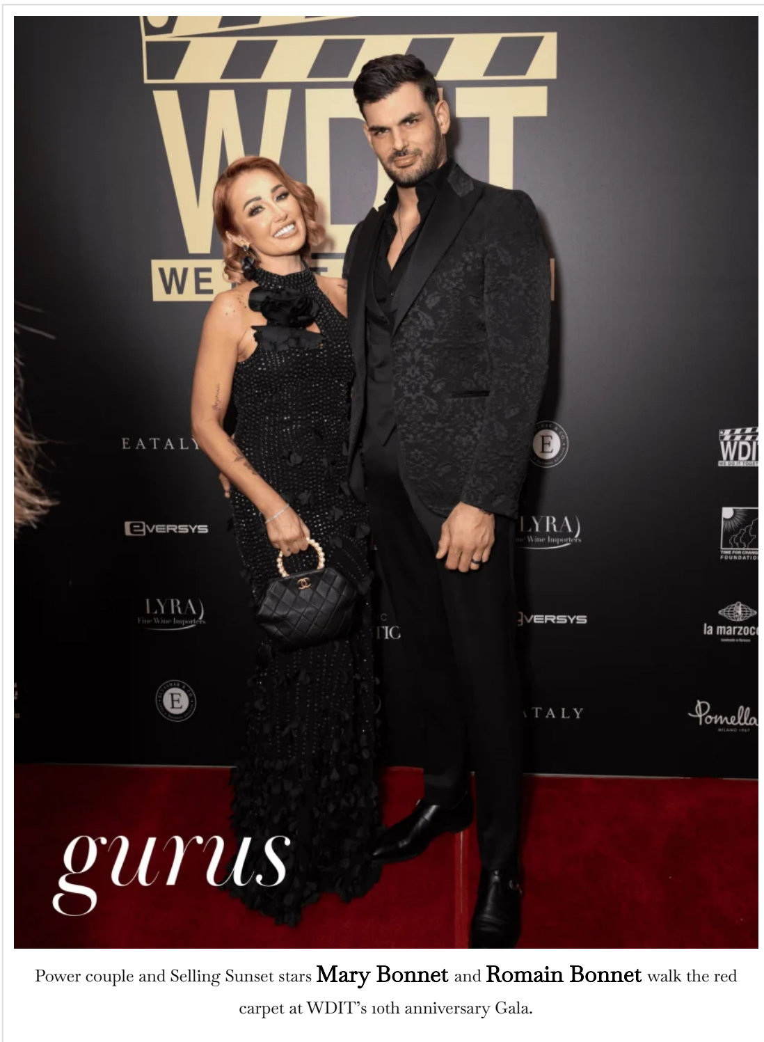
Power couple and Selling Sunset stars Mary Bonnet and Romain Bonnet walk the red carpet at WDIT's 10th anniversary Gala.