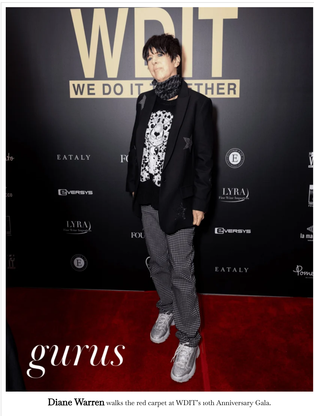
Diane Warren walks the red carpet at WDIT's 10th Anniversary Gala.